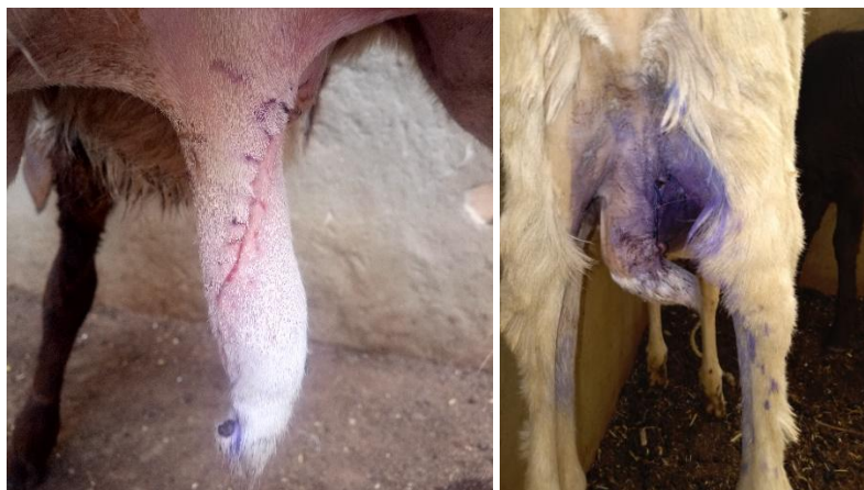
Fig. 5. Patients after full recovery