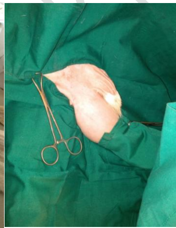
Fig. 2. Preparation of the surgical site.

The technique described by Gilbert and Fubini (2004) with slight modifications was used for the surgical repair of the scrotal hernia in the ram. Skin incision was made on the hernia mass, contents (intestines) were exposed, and adhesion was detached and eventually reduced into the abdominal cavity through the inguinal canal. Unilateral orchidectomy was performed and the ring was closed with nylon suture using simple continuous suture pattern. Fig. 3.