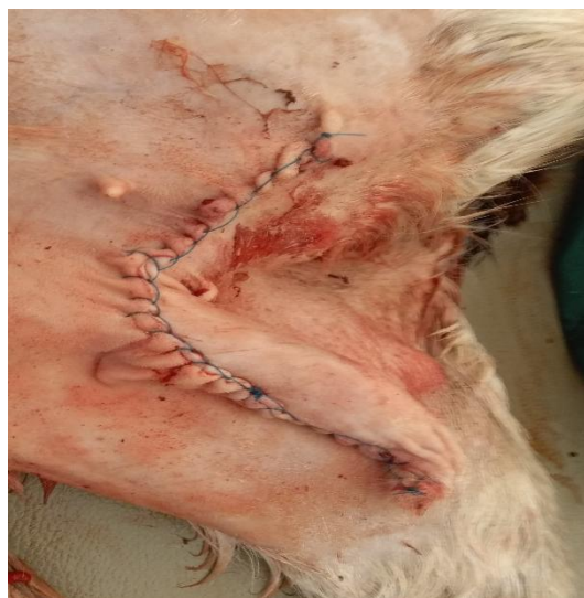
Fig. 4. Skin sutures

For cosmetic purposes and to avoid hernia recurrence and seroma formation, scrotal ablation was performed. Muscle and subcutaneous layers were layers were sutured with simple continuous sutures using chromic catgut (Huaiyin Medical Instrument Co. Ltd, Jiangsu Province, China) size 0. The skin was closed with ford interlocking suture pattern using monofilament nylon (Suzhou Acmed Import & Export Co., Ld, 436 Changjiang Road, Suzhou China) size 1. The patient was hospitalized and monitored for 12 days post surgery and was assessed to be in good condition.(Fig. 4).