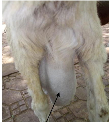
Fig. 1. swollen testicles

The animal was assessed, evaluated and feed was withdrawn for 6 hours. The patient was prepared aseptically for the surgery. The hair was clipped, scrubbing of the surgical site was done using 4% Chlorhexidine gluconate (Savlon®, Vervaadingdeur, Johnson and Johnson (pty) Ltd, London), followed by spirit (Rico Pharmaceutical IND. (Nig.) LTD. 26 Newfia street Omagba phase II layout Onitsha Nigeria) and then povidon iodine (APACCO Pharmaceutical Nig. LTD Ogun state Nigeria). The anesthesia was achieved with 2% ligocaine (Debocaine® ALDebeiky pharmaceutical industries Co.) using ring block technique (fig. 2).