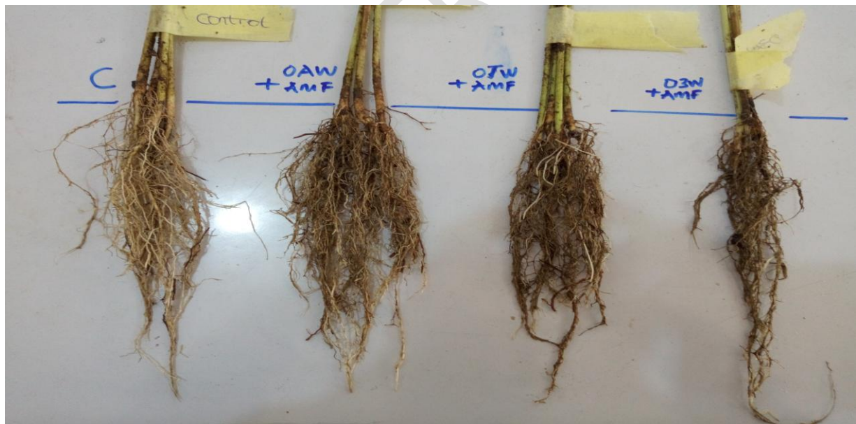
Figure 4. Shows Root morphology of A. esculentus inoculated with G. geosporum under drought stress

Means with different superscripts along the same column are significantly different ( P = .05 )