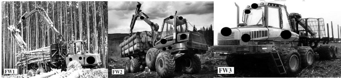
Fig. 2 Tire Forwarder with 6x6 cab suspension system – FW1; Tire Forwarder with 8x8 cab suspension system – FW2 and FW3