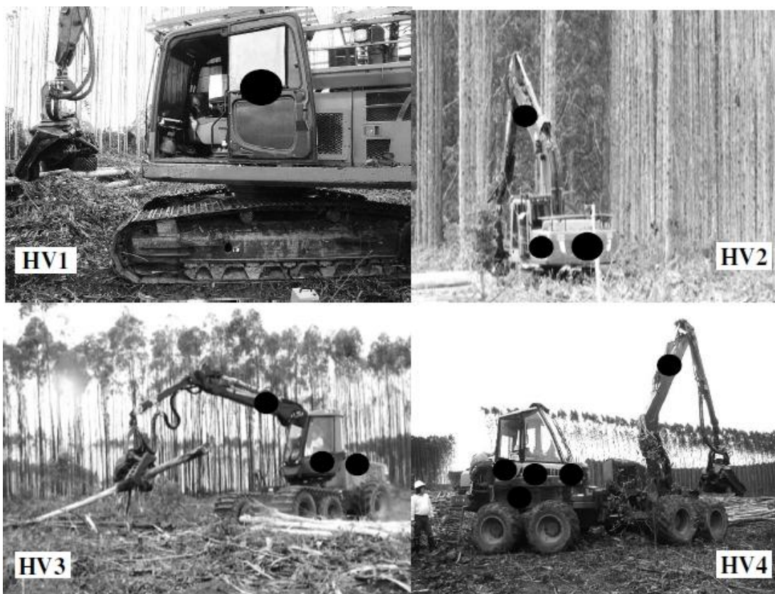
Fig. 3 Crawler Harvester– HV1 and HV2; Tire Harvester – HV3; Adapted tire agricultural machinery with Harvester head – HV4