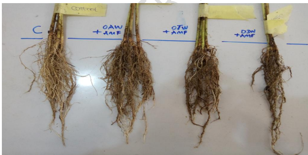
Figure 4. Shows Root morphology of A. esculentus inoculated with G. geosporum under drought stress

Means with different superscripts along the same column are significantly different ( P = .05 )