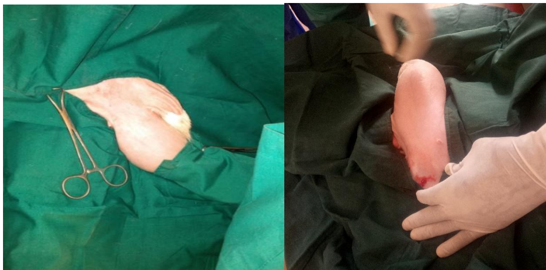
Figure 3A Draped surgical site, animal A Figure 3B Draped surgical site, animal B

The surgical technique as described by Gilbert and Fubini (2004) was used for the surgical repair of the scrotal hernia in the ram. Skin incision was made on the hernia mass, contents (intestines) were exposed, and adhesion was detached and eventually reduced into the abdominal cavity through the inguinal canal. Unilateral orchidectomy was performed and the ring was closed with nylon suture using simple continuous suture pattern. (Fig. 4 and 5).