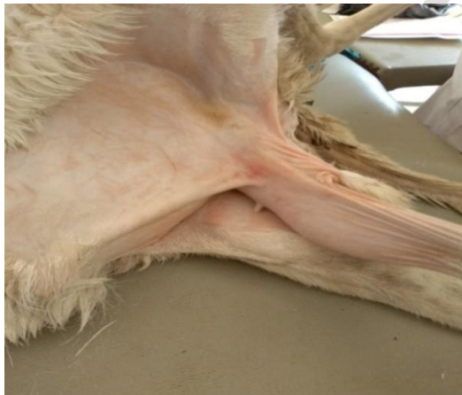
Figure 2A Surgical site preparation (animal A)

The animal was assessed, evaluated and feed was withdrawn for 6 hours. The patient was prepared aseptically for the surgery. The hair was clipped, scrubbing of the surgical site was done using 4% Chlorhexidine gluconate (Savlon®, Vervaadingdeur, Johnson and Johnson (pty) Ltd, London), followed by spirit (Rico Pharmaceutical IND. (Nig.) LTD. 26 Newfia street Omagba phase II layout Onitsha Nigeria) and then povidon iodine (APACCO Pharmaceutical Nig. LTD Ogun state Nigeria). The anesthesia was achieved with 2% ligocaine (Debocaine® ALDebeiky pharmaceutical industries Co.) using ring block technique and aseptically prepared (fig. 2A, 2B, 3A and 3B).