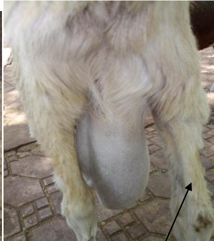
Figure 2a Swollen right testicle ( animal B)

The animal was assessed, evaluated and feed was withdrawn for 6 hours. The patient was prepared aseptically for the surgery. The hair was clipped, scrubbing of the surgical site was done using 4% Chlorhexidine gluconate (Savlon®, Vervaadingdeur, Johnson and Johnson (pty) Ltd, London), followed by spirit (Rico Pharmaceutical IND. (Nig.) LTD. 26 Newfia street Omagba phase II layout Onitsha Nigeria) and then povidon iodine (APACCO Pharmaceutical Nig. LTD Ogun state Nigeria). The anesthesia was achieved with 2% ligocaine (Debocaine® ALDebeiky pharmaceutical industries Co.) using ring block technique and aseptically prepared (fig. 2A, 2B, 3A and 3B).