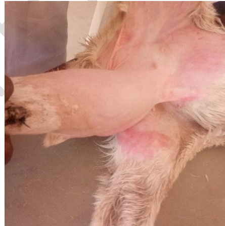
Figure 2B Surgical site preparation (animal B)