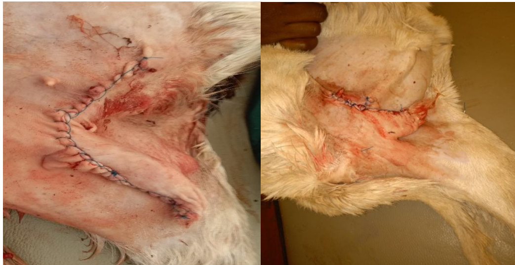
Fig. 6A. Skin closure (animal A) Fig. 6B Skin closure (animal B)

) , monofilament nylon (Suzhou Acmed Import & Export Co., Ld, 436 Changjiang Road, Suzhou China) size 1. The patient was hospitalized and monitored for 12 days post surgery and was assessed to be in good condition.(Fig. 6).