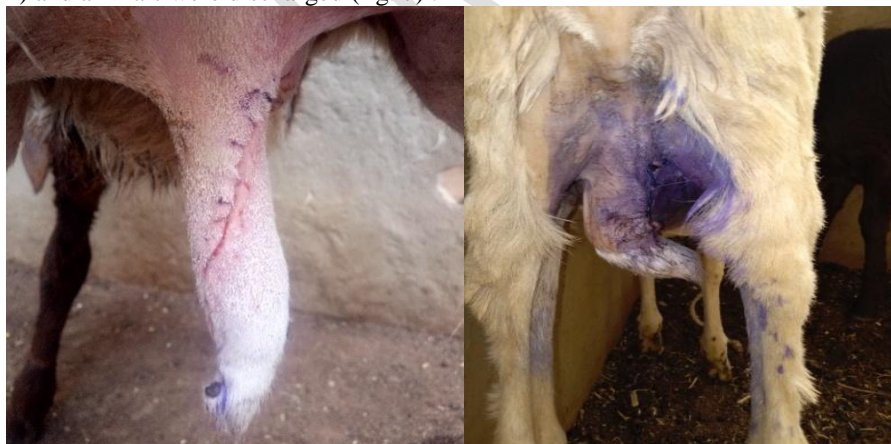
Fig. 9A. Patients after full recovery (animal A)

Analgesia was achieved using diclofenac sodium (North China pharm. CO. LTD. Shijiazhuang China) at the dose rate of 10mg/kg for three days. Multivitamins (Jubaili Agrotec, Saida-Lebanon) at 1ml/kg was administered intramuscularly for five days to enhance healing and boost appetite. The sutures were removed on the 11 th day (Fig. 2) and animals were discharged (fig. 7) .