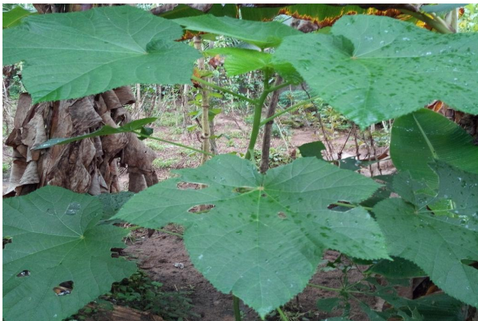
Figure 1. Picture of Abelmoschus esculentus

Abelmoschus esculentus also known as okra belongs to the family Malvaceae. It is cultivated all over Nigeria where the immature fruits are cut into pieces and used as vegetables in soup (okra soup) to which they give a slimy texture. The leaves and pods are the edible portions, preferably the young pods. Therefore, the objective of this work was to assess the influences of AMF ( G. geosporum ) inoculation on the survival of A. esculentus under drought stress.