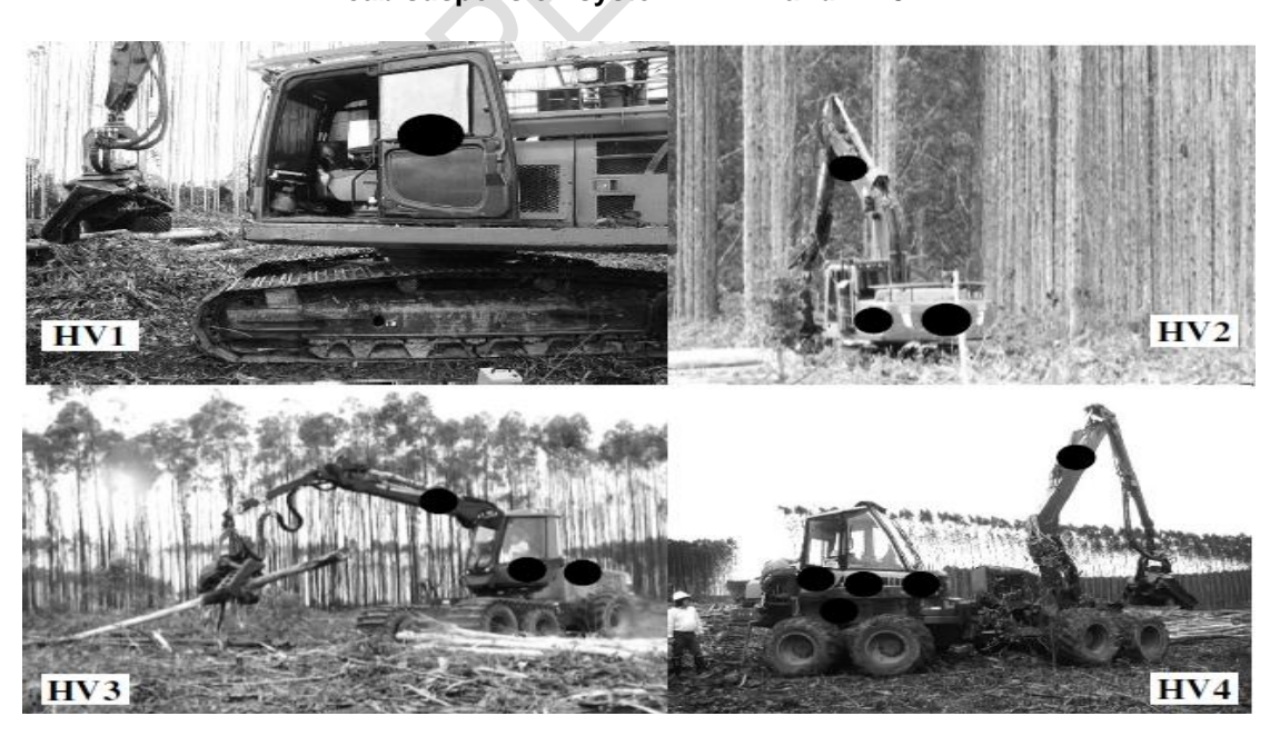
FIG. 3 Crawler Harvester – HV1 and HV2; Tire Havester – HV3; Adapted tire agricultural machinery with Harvester head – HV4