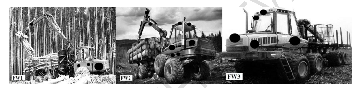
FIG. 2 Tire Forwarder with 6x6 cab suspension system – FW1; Tire Forwarder with 8x8 cab suspension system – FW2 and FW3