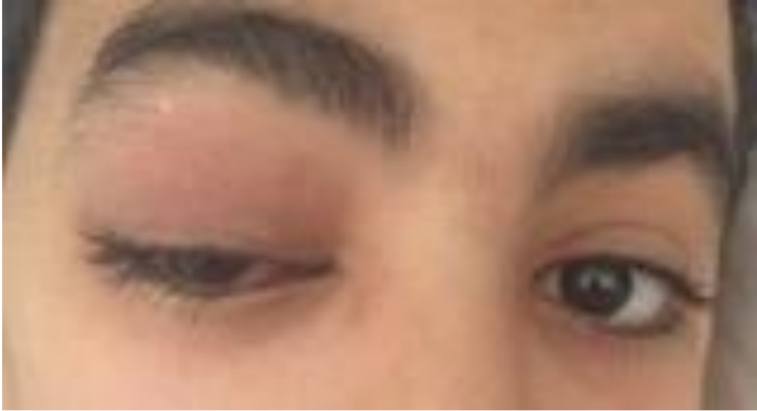
Figure : 4