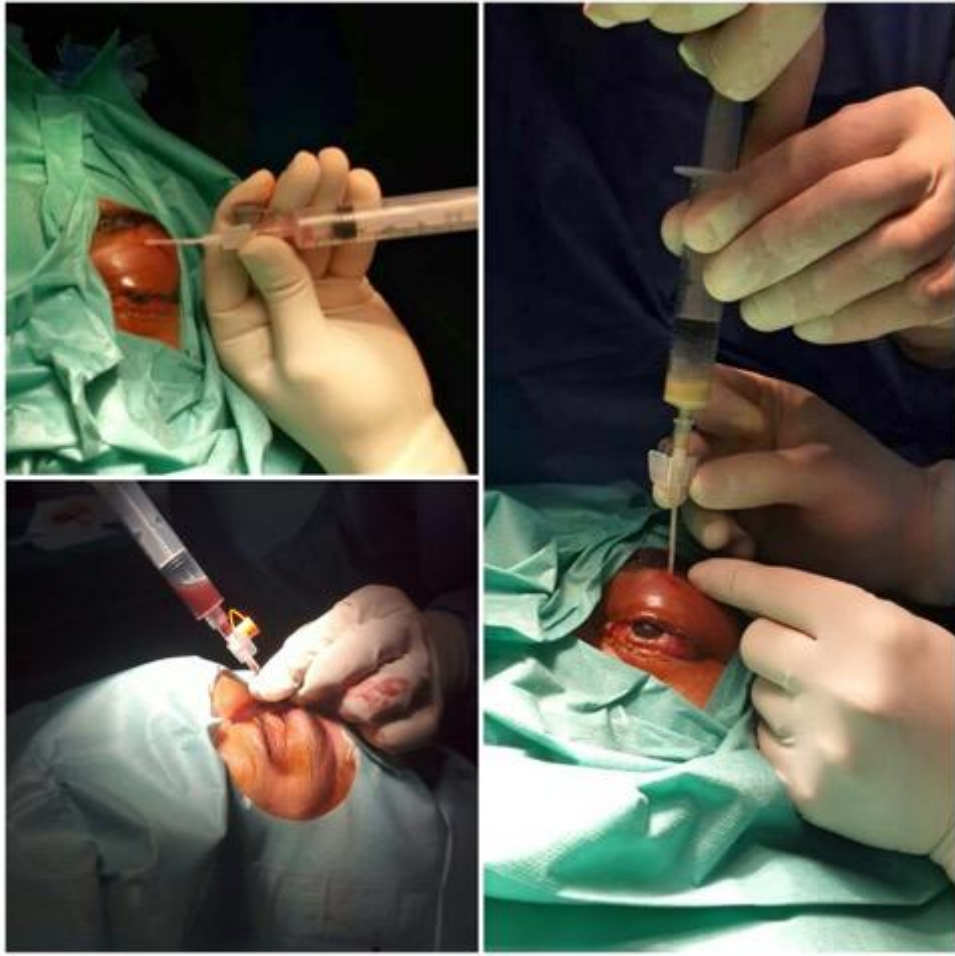
Figure : 3