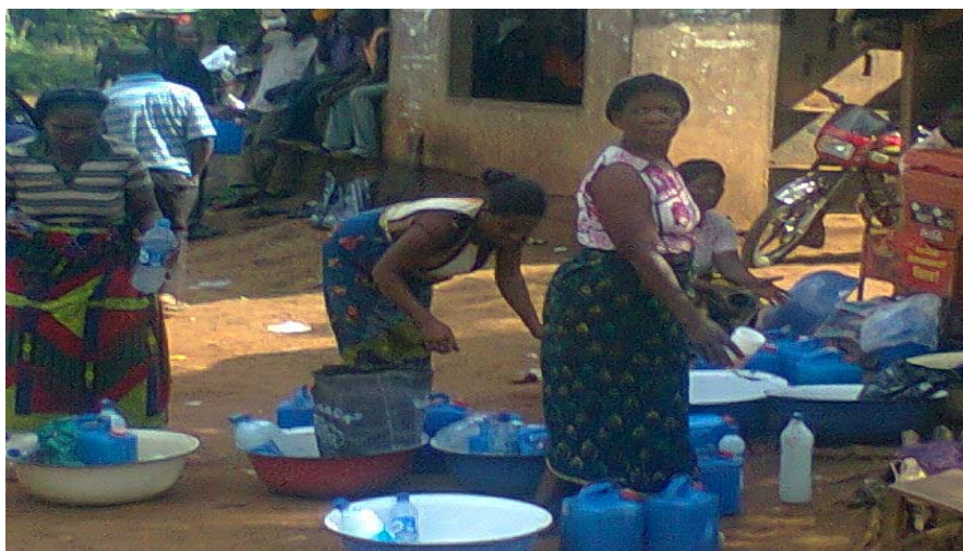
Plate 2. Palm wine retailing in plastic containers in the study area