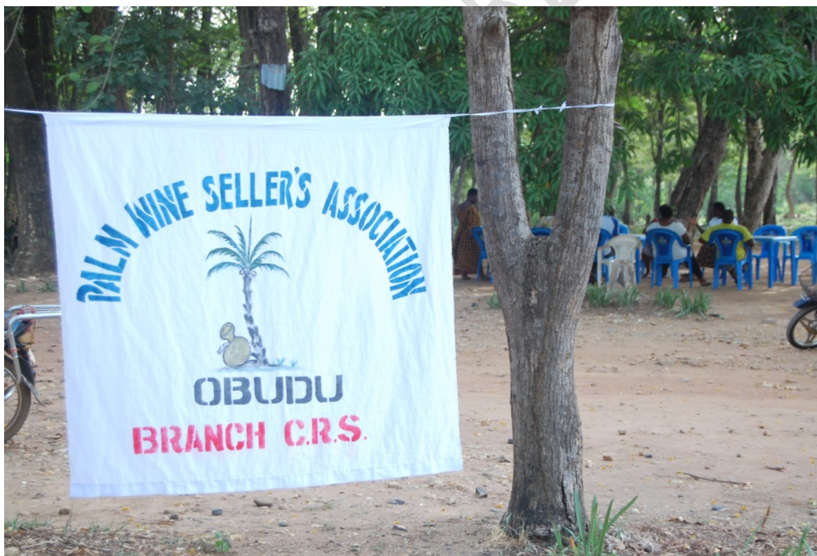
Plate 1: Organized Palm Wine Sellers Association in Obudu (OBUDU)