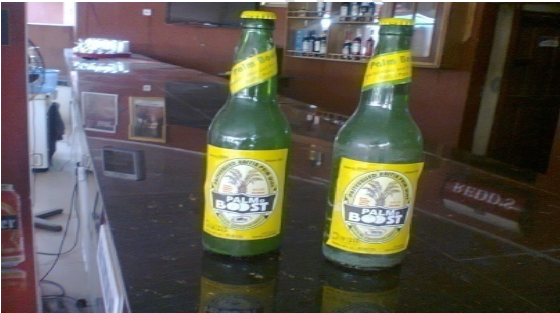
Plate 3. Palm wine retailing in sealed bottles