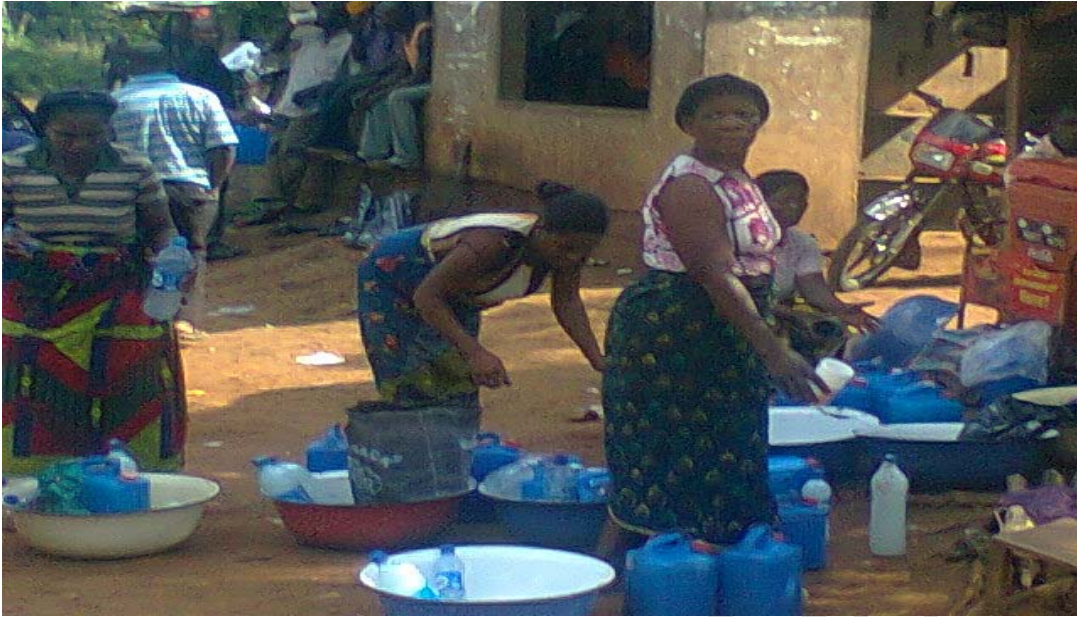
Plate 2. Palm wine retailing in plastic containers in the study area