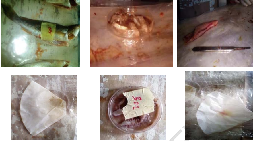
Filtration and observation SC digestion (NaClO+ HNO 3 ) Filtration