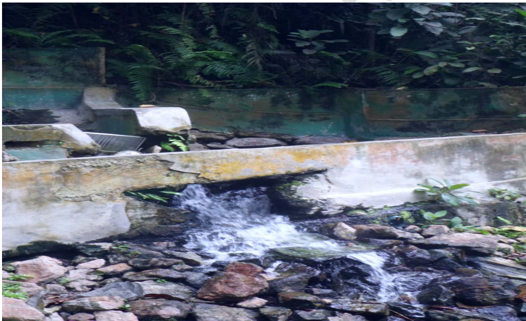
Plate 2: Picture showing the source of warm spring at Ikogosi