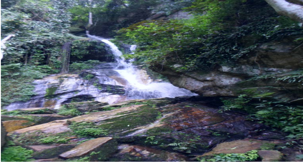
Plate 3: Arinta waterfall