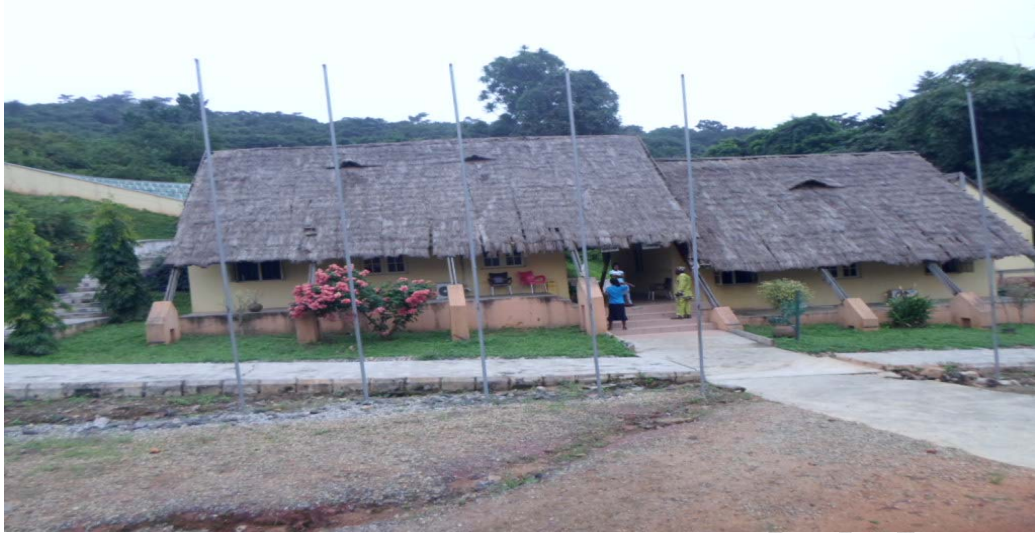
Plate1: A building showing relaxation centre with walk way at Ikogosi warm spring