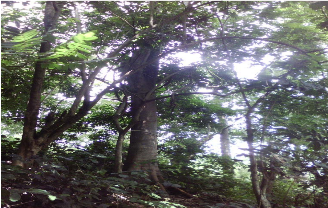
Plate 4: Vegetation in one of the sampled plot in Arinta waterfall watershed