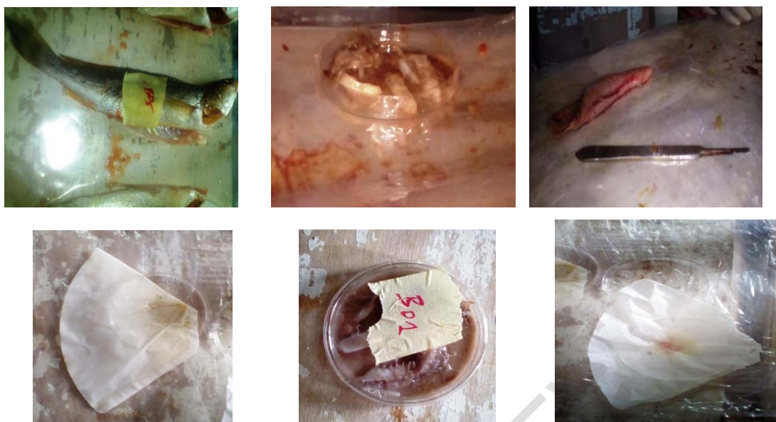
Filtration and observation SC digestion (NaClO+ HNO 3 ) Filtration