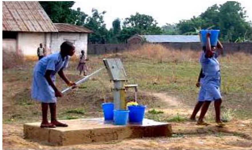
Young Girls Fetching Water Borehole in Nigeria