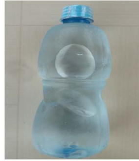
A Sample of Sealed Bottled Water In Nigeria