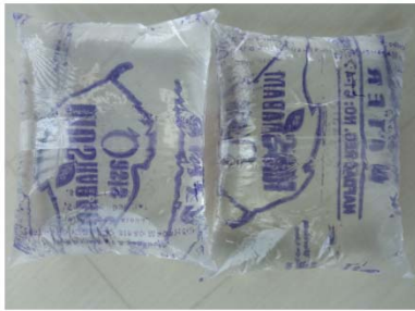
A Sample of Sealed Sachet Water In Nigeria