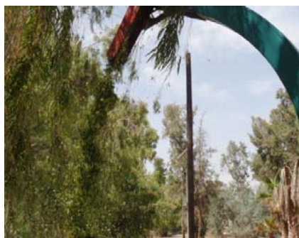
Figure 3: Cutting output