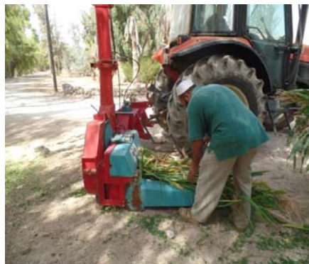
Figure 2: Feeding of the machine operated by the tractor