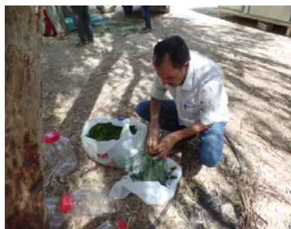
Figure 4: Filling process