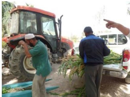
Figure 1: Corn before cutting

The images and figures from 1 to 4 steps show samples preparing for fermentation. The green corn and the alfalfa were brought and introduced to a device slicing machine which used to cut the plants into small homogeneous pieces. The fodder mixtures were then prepared with a varying ratio in preparation for 50 days of fermentation.