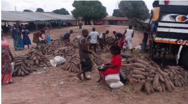
212 Figure 4.1: Loading of yams under the sunlight at Ukum yam market