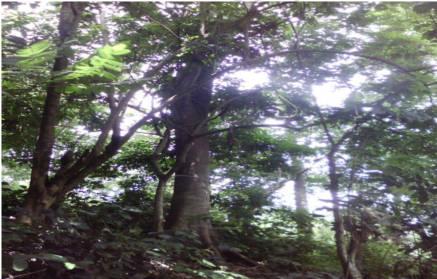
Plate 4: Vegetation in one of the sampled plot in Arinta waterfall watershed