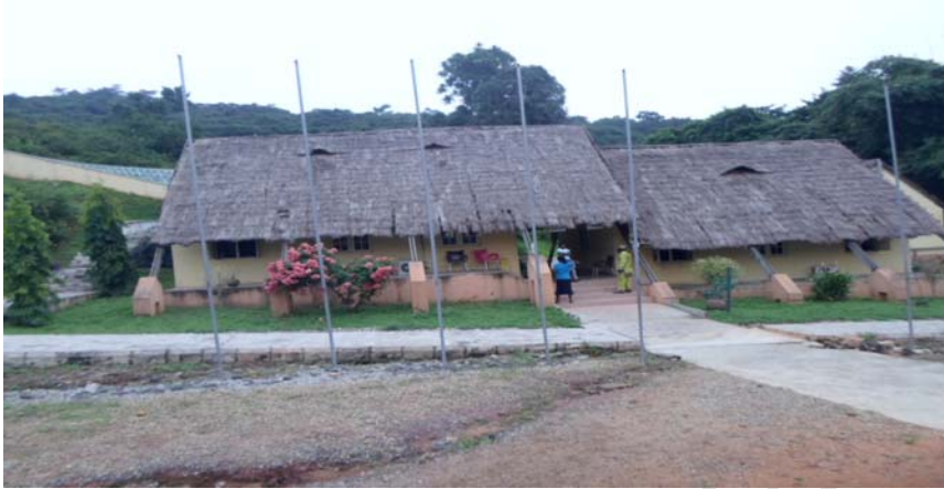
Plate1: A building showing relaxation centre with walk way at Ikogosi warm spring