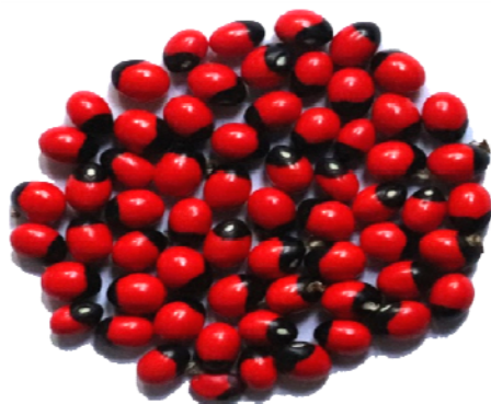
Figure 1. Image of Abrus precatorius L. seed.