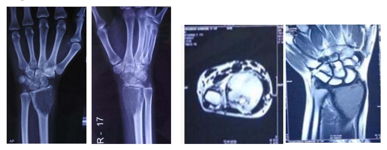
Fig 2: Pre-operative X-ray and MRI showing GCT of distal end radius (case-1)

Six patients were treated for Campanacci Grade II & III giant cell tumor of the distal radius of which 4 patients had grade II and 2 patients had grade III tumour. All the six patients were operated with wide excision, autogenous non-vascularised fibular graft and temporary wrist arthrodesis. Follow up included clinical and radiographic assessment and functional assessment using the Disabilities of the Arm, Shoulder and Hand (DASH).