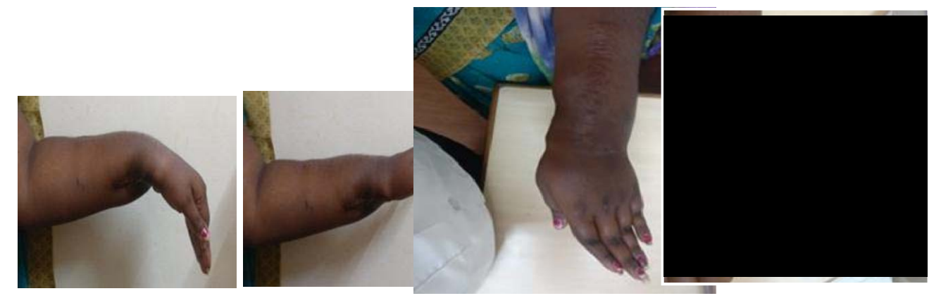
Fig 12: Post operative Range of movements after revision surgery.