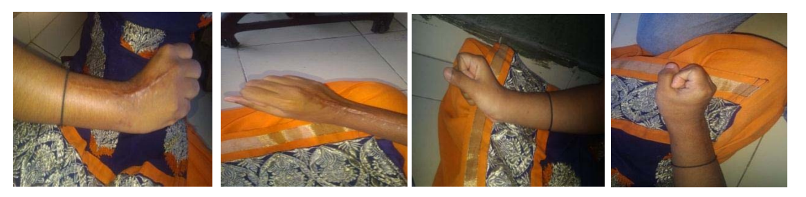
Fig. 10: Post operative Range of Movements (Case 1)