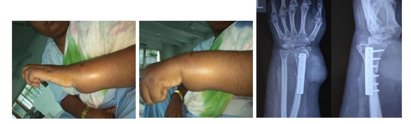
Fig 11: Post operative Range of movements with recurrence (clinical picture and Xray)