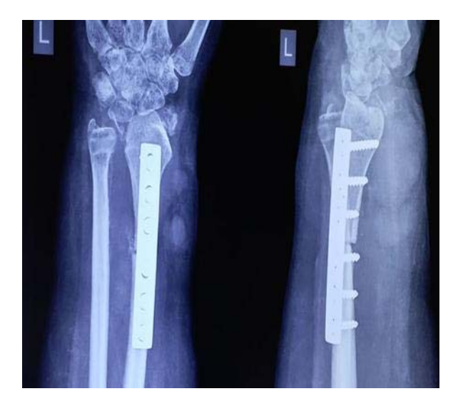
Fig 8: Xray after mobilization of wrist (Case 1) Fig 9: Xray after mobilization of wrist (Case 2)