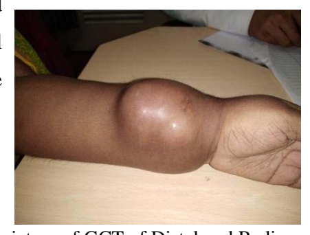
Fig 1: Clinical picture of GCT of Distal end Radius

bone grafts or polymethyl-methacrylate<sup>(4,5)</sup>, resection and reconstruction with vascularized or nonvascularized proximal fibula, resection with partial wrist arthrodesis using a strut bone graft, resection and complete wrist arthrodesis using an intervening strut bone graft are advocated in literature<sup>(2)</sup>.