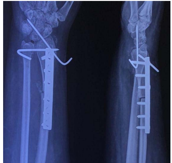
Fig. 7: Post Operative Xray (Case 2)