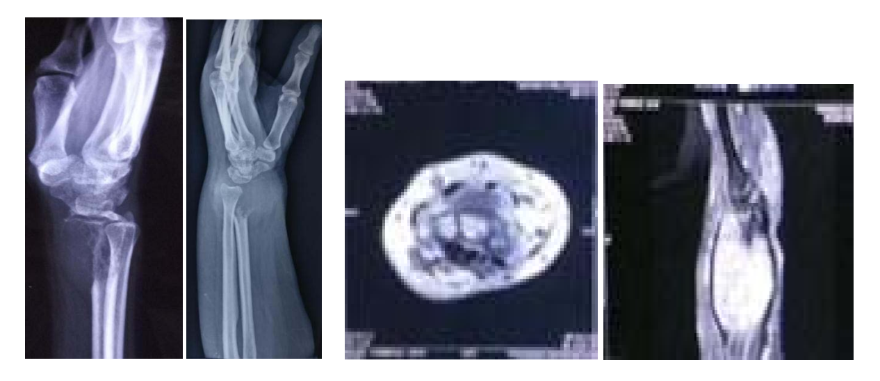
Fig 3: Pre-operative X-ray and MRI showing GCT of distal end radius (case-2)