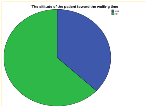
Fig 3.1.4: Attitude of the respondents towards the waiting Time

The figure below illustrates the attitude of the respondents towards the waiting time and the discussion is given below.