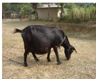
Fig.1 Solid black

Others : Combination of different colours or mixed colour in the body.