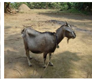
Fig. 4 Brown bezoar