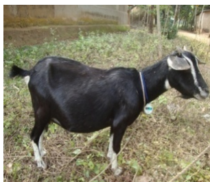
Fig. 2 Toggenburg