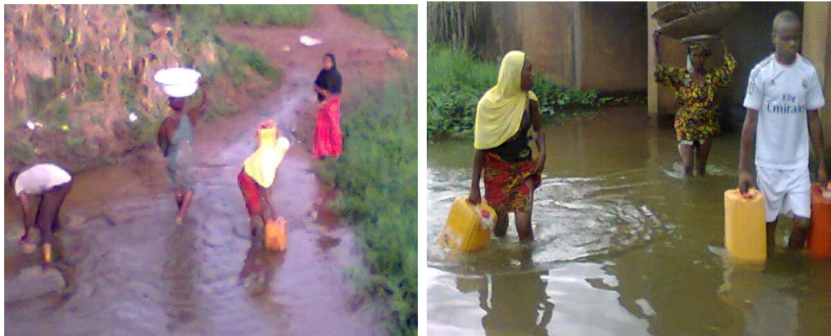
Plate 1: Ankpa Urban Residents abstracting water from Imabolo Stream

is important to examine the quality status of streams on which people depend, the seasonal variations in the quality of such stream and highlight the implications of using water of such status to the users. This will enable researchers to suggest appropriate policy intervention measures to reduce the level of risks to which users of such streams are exposed to.