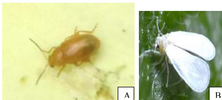
Figure 3. Major insect pests of okra at Dang and Gouna: A- Podagrica decolorata ; B- Bemisia tabaci .