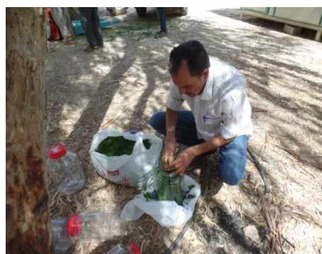
Plate 4: Filling process