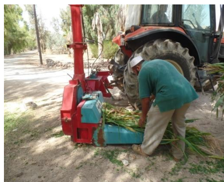
Plate 2: Feeding of the machine