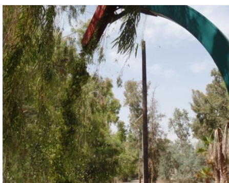
Plate 3: Cutting output