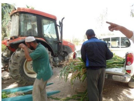
Plate 1: Corn fodder before cutting

Plates 1 to 4 show steps I to 4 of samples preparing for fermentation. The fodders of green corn and the alfalfa were brought and introduced to a device slicing machine which was used to cut the plants into small homogeneous pieces. The fodder mixtures were then prepared with a varying ratio in preparation for 50 days of fermentation (table 1). Crude protein level test was carried out after fermentation in the research center forage lab.