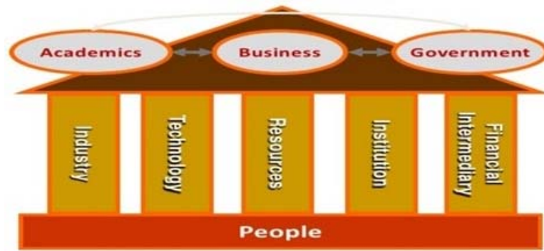
Figure 1 The Triple Helix