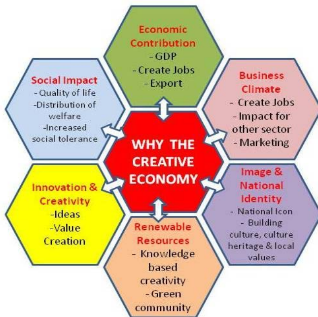
Figure 2. The Importance of Creative Economy

relationship, mutually supportive, and symbiotic relationship of mutualism between the three actors in relation to the foundations and pillars of the model of the creative economy will determine the development of a strong and sustainable creative economy.