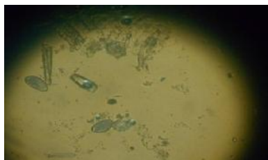
Fig. 2. Larvae of strongyloides