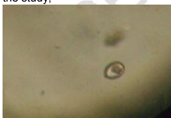
Fig. 1. Coccidia Oocyst

The following are the figures of eggs of parasites detected in the various methods used for the study;