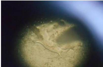
Fig. 3. strongyle eggs