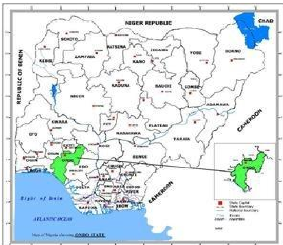
Figure 2a: Map of Nigeria Showing Ondo State Figure 2b: Administrative Map of Ondo State Showing Owo LGA [25]