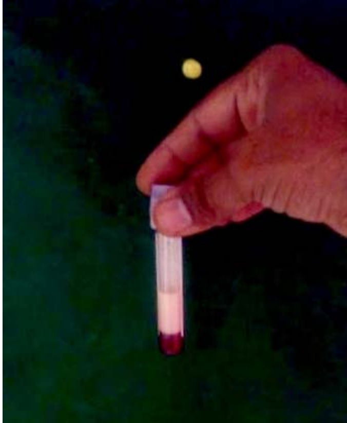
Figure1:Lipemic serum with a milky white appearance.