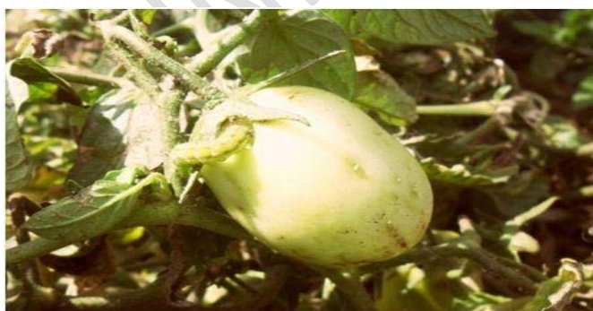
Figure 2: Fruitworm ( Helicoverpa amigera ) attacking fruit

Fruitworms ( Helicoverpa amigera ) (30%) also cause much destruction in the farms especially in the cabbage and tomato farms. They eat through the leaves of many crops and the fleshy parts of the fruits as seen in Figure 2. Other insect pests indicated by farmers in Santa were aphids (28%) that attacked mostly cabbage, potatoes and tomatoes; whiteflies (21%) and black ants (12%).