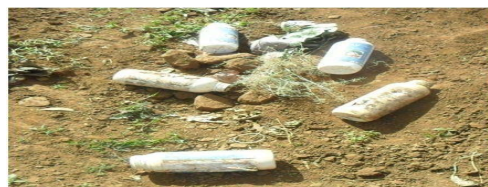
Figure 3: Pesticide containers improperly disposed of on-farm and neighbourhood