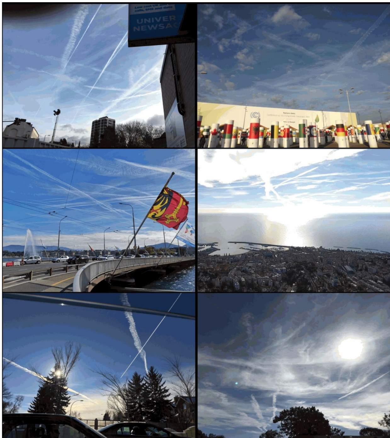
Fig. 1. Geoengineering particulate trails with photographers' permission. Clockwise from upper left: London, England ; Paris, France ; Sanremo, Italy ; San Diego, California, USA ; Calgary, Alberta, Canada ; Geneva, Switzerland.