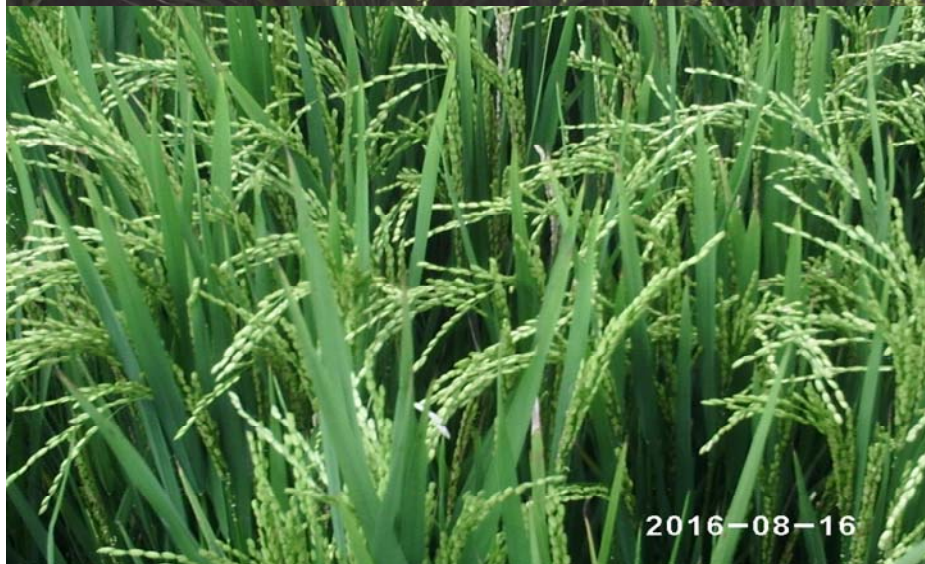
Pictures: 1- soil treated with mineral fertilizers – 2- yeast combined with mineral fertilizers – 3- bacteria combined with mineral fertilizers