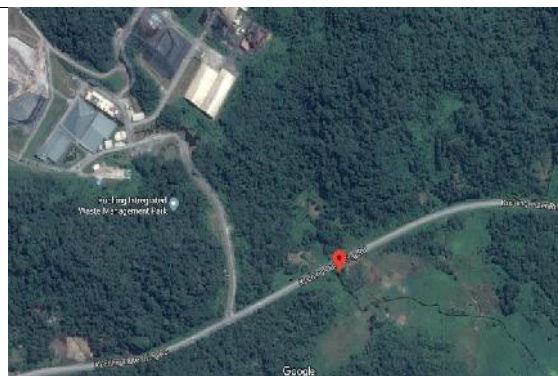
Figure 2. Downstream Sungai Endap.