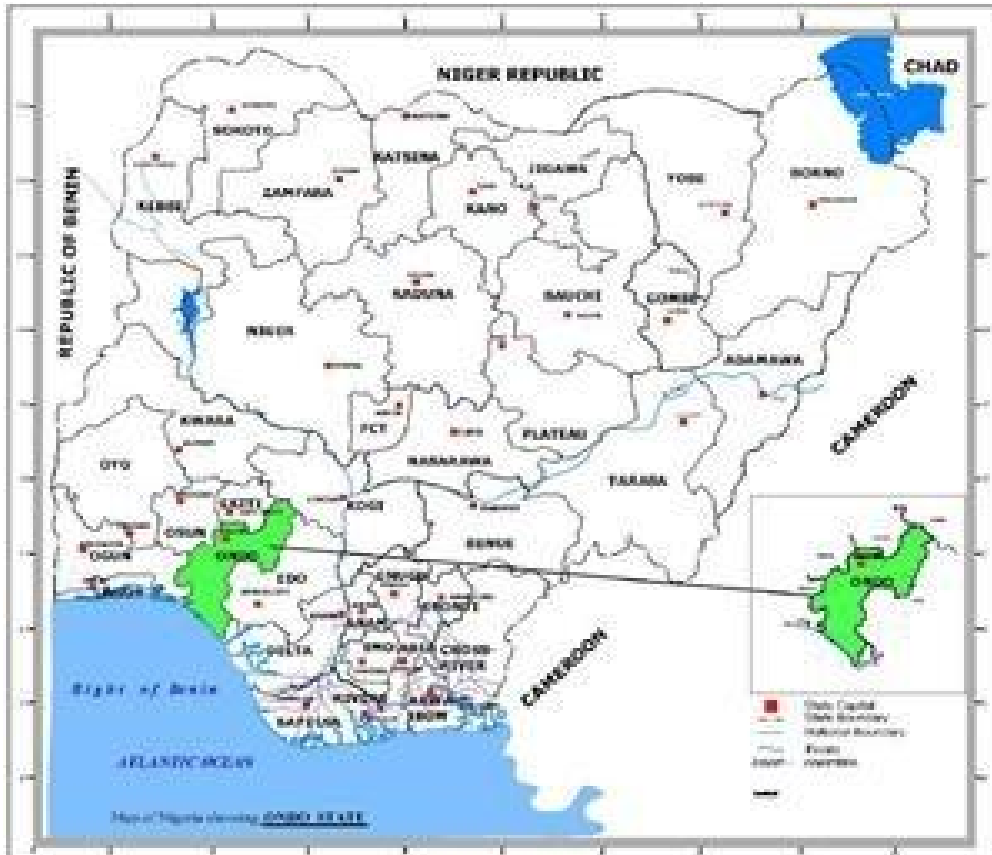
Figure 2a: Map of Nigeria Showing Ondo State Figure 2b: Administrative Map of Ondo State Showing Owo LGA (Oluwagbamila and Samson, 2017)