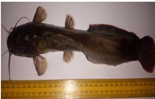
1C- Clarias anguilaris (Clariidae)