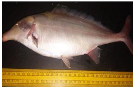
1B- Mormyrus rume (Mormyridae)