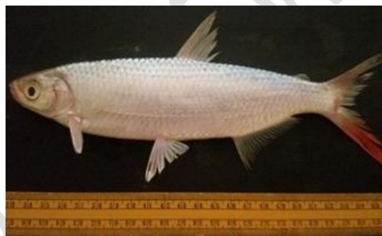
1D- Hydrocynus forskalii (Characidae)