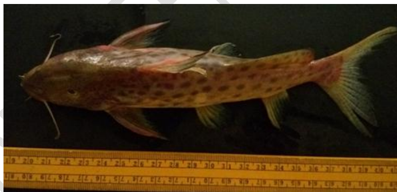
1E- Synodontis nigrita (Mochokidae)

Plate 1(A-E): Picture of the five dominant fish families collected from the inland waters of Kebbi State, Nigeria.