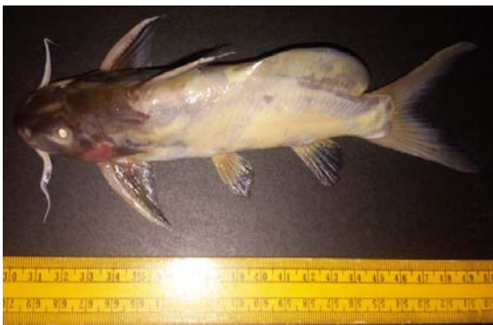
1A- Bagrus bayad (Bagridae)