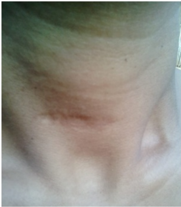
4a): Scar of the first patient