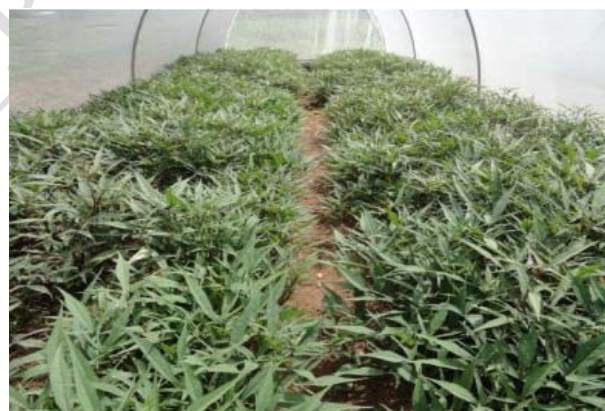
Fig. 1. Tunnel of multiplication of cuttings of sweet potato.

season (July in August) and a small rainy season (September in October). These periods are less and less marked these last years [11]. The hydrography mainly consists of the river Bandama and the N'Zi and its ponds hillsides which drain Bouaké [12]. The vegetation is constituted by savanna raised with several species of Poaceae [13]. Soils are ferrallitic, averagely saturated, reshaped, shallow and stemming from a material of granitic change with a sandy-clayey texture [14]. The mean annual precipitation are 1200 mm of rains [15], with a mean annual temperature of 25.73 °C [10].