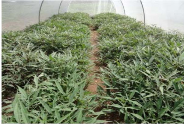
Fig. 1. Tunnel of multiplication of cuttings of sweet potato.