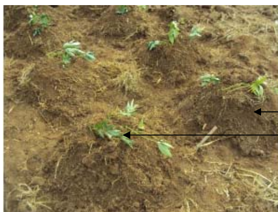
Fig. 2. Hump cuttings planting (Dibi and a l, 2015)

The parcel was cleaned with a machete and the crop residue was removed. These crops residues were removed from the plot and the ground was furnished, followed by the construction of humps at a height of at least 60 cm to prevent the phenomena of settlement due to rains.