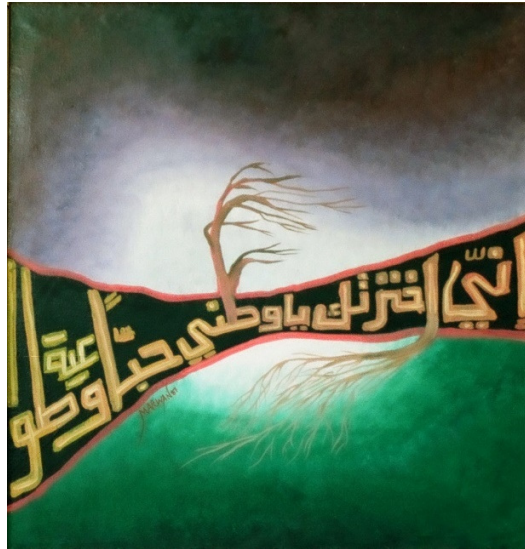
Fig. 6. Poster 6, Marwan Al-allan