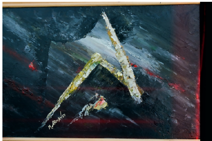
Fig. 7. Poster 7, Marwan Al-Allan

The symbol of the horse is usually used in the Palestinian poster to express the revolution, rebellion, and rejection to yield, and these are adjectives characterized by the Palestinian in his confrontation against the Israeli Zionist . As seen in Figure 8 (pixels.com, 2017), the poster consists of many horses with different forms and shapes, executed by the method of graphic lines and dotting, is lifting its front legs and stretching its head upwards. The artist Marwan AL-Alan employs the horse to express the pride that the Palestinian fighters have when confronting the Israeli Zionist . In the poster, there are four horses rising from a destroyed ground to indicate that all attempts of destruction exercised by the Israeli Zionist against the Palestinian person will not stop him from starting a revolution, but will be a reason for that revolution. The four horses indicate the four colors of the Palestinian flag, but as for the fifth horse, it is to indicate the Palestinian color itself, and inside it features of Palestine had been drawn; as if the horses are the ones who protect the country. The