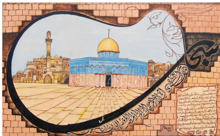
Fig. 2. Poster 2, Marwan Al-Allan

119 As been stated before, Jerusalem is the most important symbol in the Palestinian poster 120 visual art. Many of Marwan Al-Alan artworks are related to Jerusalem. In Figure 3 121 (pixels.com, 2017), the scene of Jerusalem city is drawn by the method of sketching with 122 very simple coloring, and is executed with black and white of light colors. The poster 123 represents the city with its past history and current situation. The strokes in the back 124 represent the modern western Israeli Zionist Jerusalem, while the rest of the painting 125 represent the Arab Eastern Jerusalem, where domes, traditional buildings, Roman ruins and 126 the architectural style that combines between the old and the new can be seen. In the front, 127 the wall of the old Jerusalem is seen and then the racist neighbor's that was built by the 128 occupied Israel to separate between the places where Palestinians live and the places 129 where the Jewish settlers live. The idea of the poster stands on the red line that separates 130 the city, which is the line of blood that represents the Israeli assaults on the city and its 131 people.