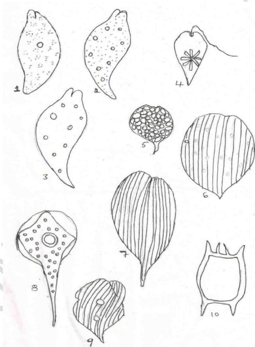
Fig.2. Camera lucida diagrams of euglenoids

Euglenophyceae are generally abundant in waters rich in organic matters [19]. A total of 10 species of euglenophyceae under 3 genera were recorded during the present study. Camera Lucida diagrams of the euglenoids recorded during the study are represented in Fig. 2.