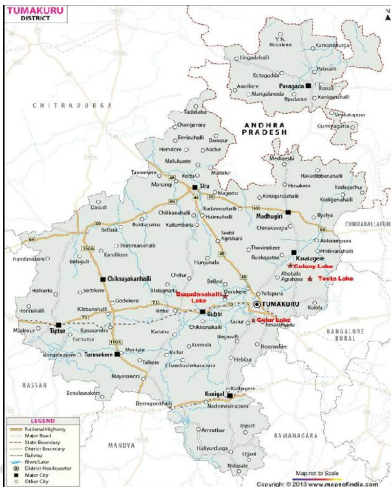
Fig.1. Map showing the location of the selected sampling lakes in Tumakuru district

Guluru, Bugudanahalli, Colony and Teeta are the four lakes situated within the radius of 30 kilometers from Tumakuru city were selected for the study and shown in Fig. 1.