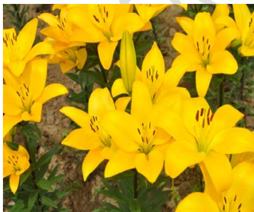
Asiatic liliun cv. Serreda