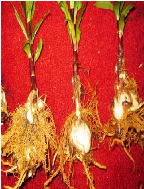
Plants of Asiatic lily cv. Serreda