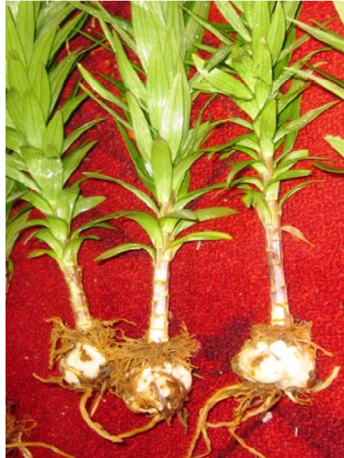
Plants Asiatic lily cv. Navona