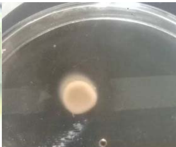
Fig 2: sensitivity of M. mycoides sub sp mycoides (Local strain) to N. Sativa