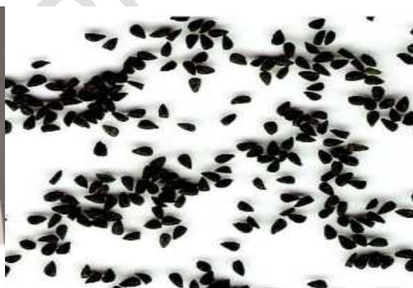
Nigella sativa seeds

Nigella sativa has a bactericidal effect on the growth of ( Mmm ). All the Swab samples revealed no growth of mycoplasma.