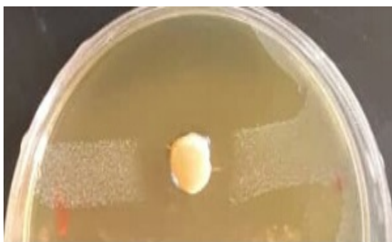
Fig 3: sensitivity of M.mycoides sub sp mycoides (old strain) to Nigella Sativa .