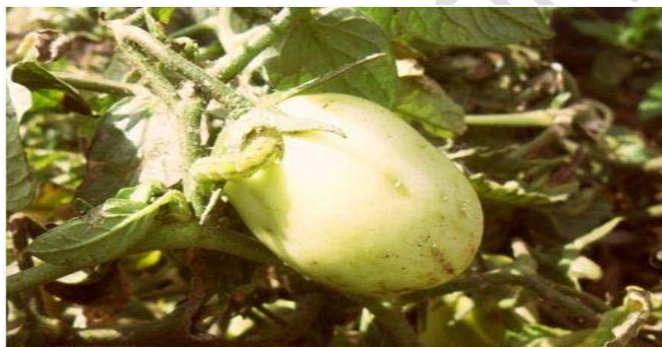
Figure 2: Fruitworm ( Helicoverpa amigera ) attacking fruit

Fruitworms ( Helicoverpa amigera ) (30%) also cause much destruction in the farms especially in the cabbage and tomato farms. They eat through the leaves of many crops and the fleshy parts of the fruits as seen in Figure 2. Other insect pests indicated by farmers in Santa were aphids (28%) that attacked mostly cabbage, potatoes and tomatoes; whiteflies (21%) and black ants (12%).