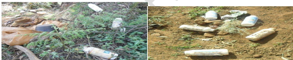
Figure 3: Pesticide containers improperly disposed of on-farm and neighbourhood

Sixty four (53%) market gardeners discarded their empty containers into the environment as shown in figure 3, (24%) burnt pesticides containers, (11.5%) buried them, (6%) took the empty containers to pesticide dealers and (5%) used them as drinking cups and eating bowls.