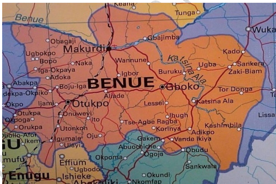
Fig 1: Map of Benue State Adapted From Dzurgba (2012)

Cluster and simple random sampling techniques were used to select the respondents for the study. Benue State were clustered into three senatorial districts including North East senatorial district (Zone A) North West Senatorial District (Zone B) and Benue South Senatorial district Zone (C). One Local Government Areas was randomly selected from each of the clustered senatorial districts: Kastina-Ala selected from Zone A; Buruku selected from zone B; and Otukpo Local Government Areas selected from Zone C respectively. Furthermore, two (2) council wards were randomly selected from each local government area with Mbacher and Mbajir Council Wards selected from Kastina-Ala Local Government