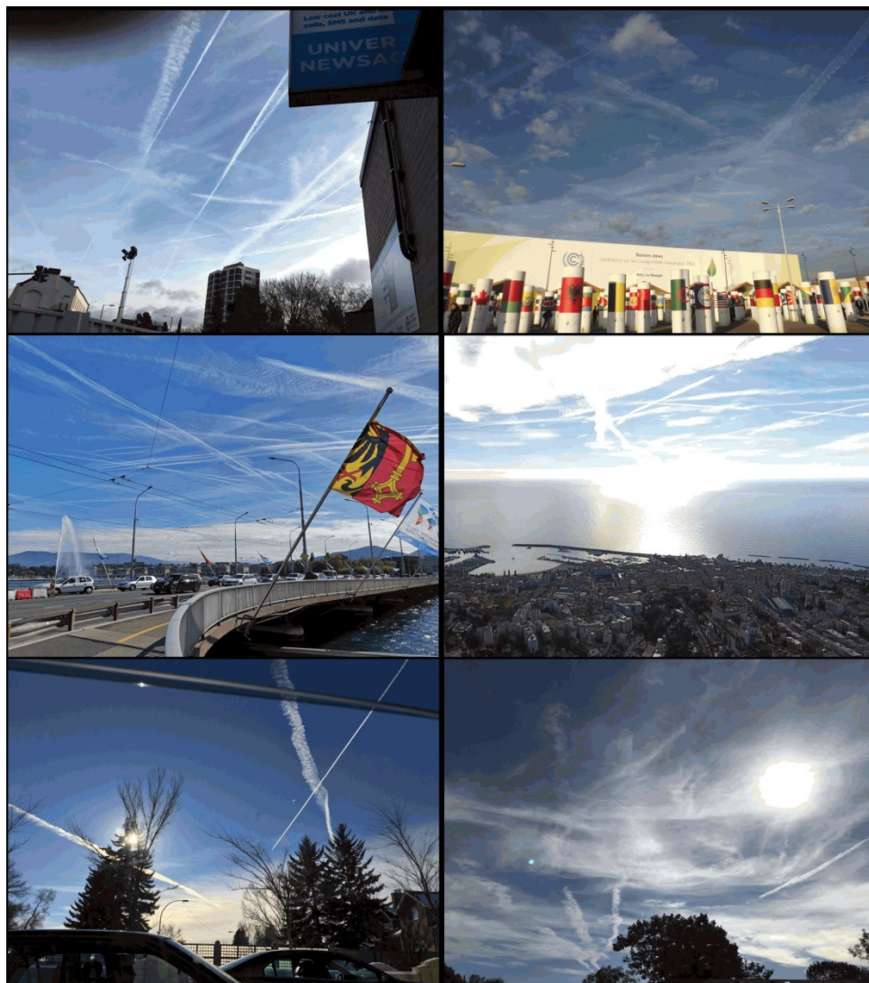
Fig. 1. Geoengineering particulate trails with photographers' permission. Clockwise from upper left: London, England ; Paris, France ; Sanremo, Italy ; San Diego, California, USA ; Calgary, Alberta, Canada ; Geneva, Switzerland.