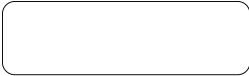
Figure 2.1. Decomposed Theory of Planned Behaviour [3]. Organizational Behaviour and Human Decision Processes 50(2) pp., 179-211