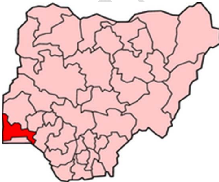
Figure 1. Map of Nigeria showing Ogun state.

The ratio for ophthalmologist for Ogun state is 5.5 per million populations, consequently, it exceeded the vision 2020 target of 4.0 in 2014 by 37.5%. For ophthalmic nurses, the ratio is 6.3 per million populations which are 63% of the target of 10. The ratio for optometrist in the state is the lowest with 3.8 per million populations, 19% of the target of 20. [4]