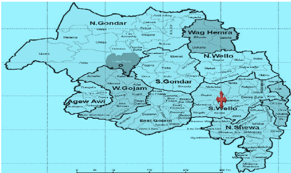
Fig 1: Amhara Regional State Map

Labeling of households in the study area was done prior to the actual study to construct sampling frame and to determine the total number of households found in the study area. The actual respondents were selected by systematic sampling method at household level. There were 6568 households in the study area making ‘K’ value approximately 16. The first household was selected by simple random sampling. Then every 16 th house was taken until the sample size is reached.