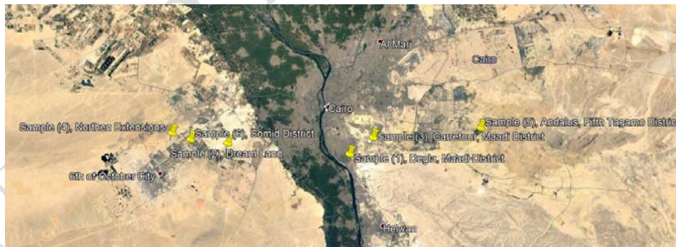
Fig. (1) Sample Locations

These samples were initially classified according to Unified Soil Classification System. The liquid limit and plastic limit of each of these six samples were calculated. Free Swell test and Swelling pressure tests using Oedometer method as ASTM (D-4564) of each sample was performed. The results obtained are given in table (2).