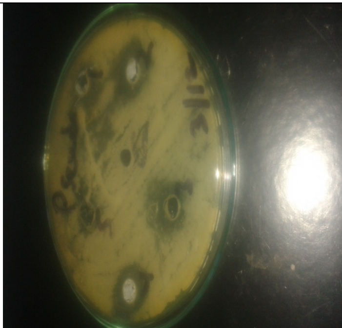
Fig. 3 Bioactivity of extracts for against MRSA